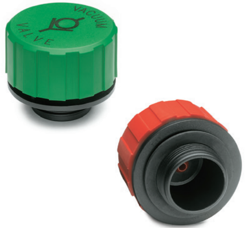
ELESA Original design

Tests carried out under standard laboratory conditions at 23°C. Values to be considered only as guidelines. Please contact ELESA Technical Department for further chemical resistance details to particular liquids not reported in the table.