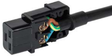
Example with assembled cable