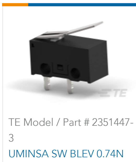
TE Model / Part # 2351447-3 UMINSA SW BLEV 0.74N 0.1A/30VDC NO PCB