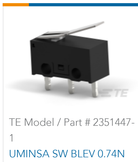
TE Model / Part # 2351447-1 UMINSA SW BLEV 0.74N 0.1A/30VDC SC PCB