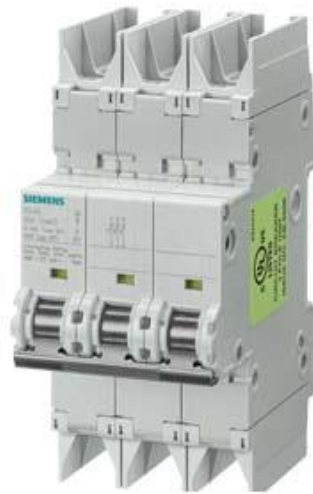
CIRCUIT BREAKER 10KA, 3POLE, C, 0.3A ACC. TO UL 489 - 480Y/277V