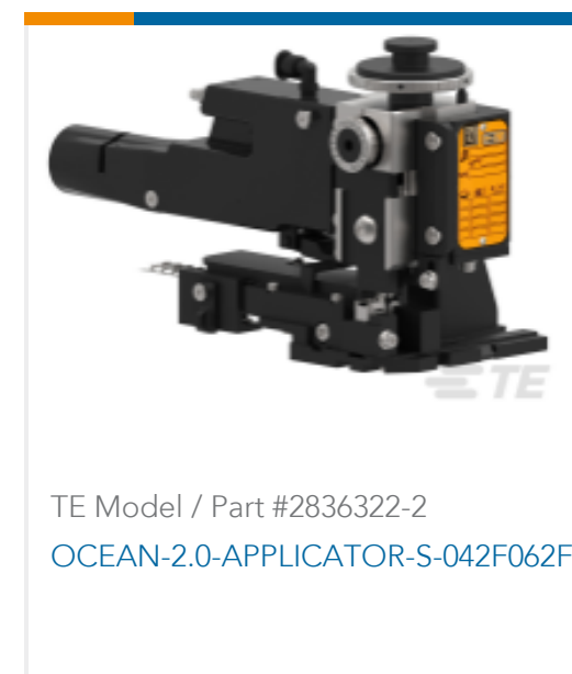
TE Model / Part #2836322-2 OCEAN-2.0-APPLICATOR-S-042F062F