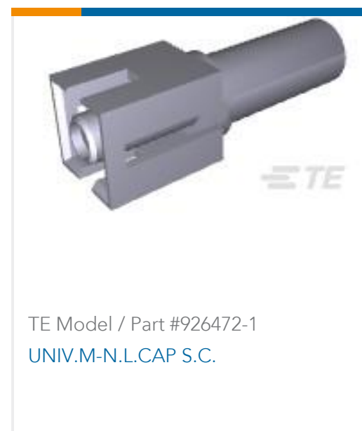
TE Model / Part #926472-1 UNIV.M-N.L.CAP S.C.