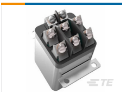
TE Part #1617807-5 FC-335-SY8= RELAY, 3PST