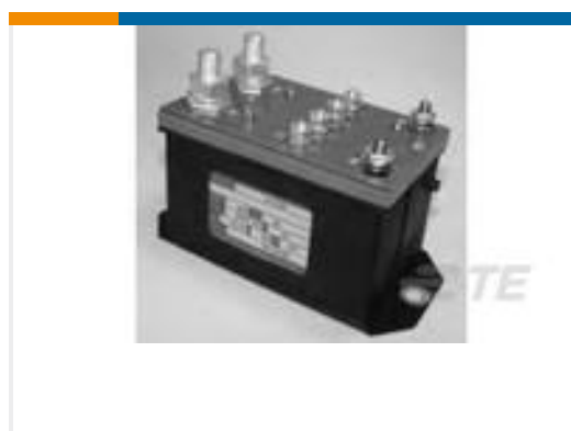
TE Part #1616058-6 A703CD (FAA/PMA)=RELAY