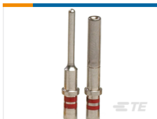
TE Part #ZPF000000000001261 097-0267-16 A1267