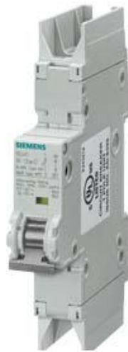
CIRCUIT BREAKER 10KA, 1POLE, C, 16A ACC. TO UL 489 - 277V