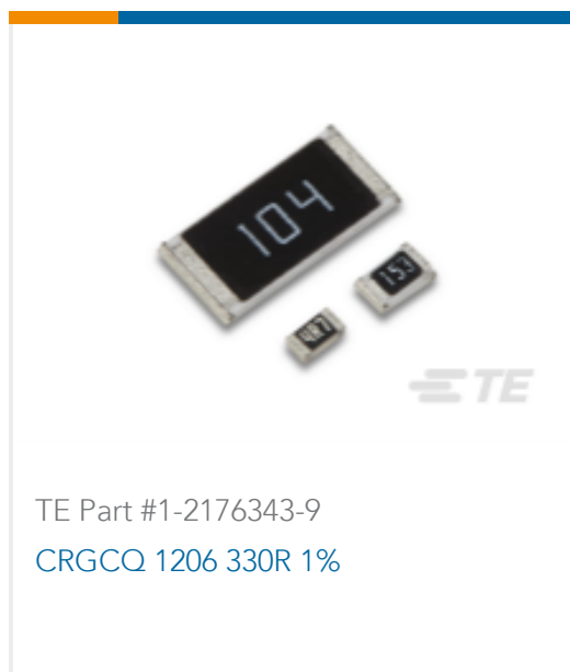
TE Part #1-2176343-9 CRGCQ 1206 330R 1%