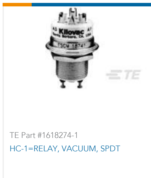
TE Part #1618274-1 HC-1=RELAY, VACUUM, SPDT