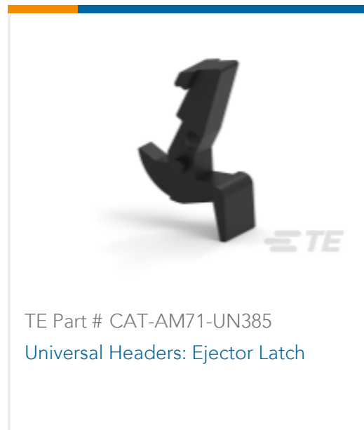
TE Part # CAT-AM71-UN385 Universal Headers: Ejector Latch