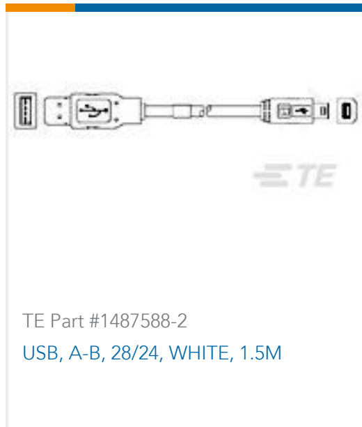
TE Part #1487588-2 USB, A-B, 28/24, WHITE, 1.5M