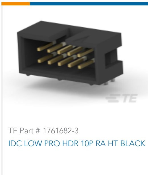
TE Part # 1761682-3 IDC LOW PRO HDR 10P RA HT BLACK