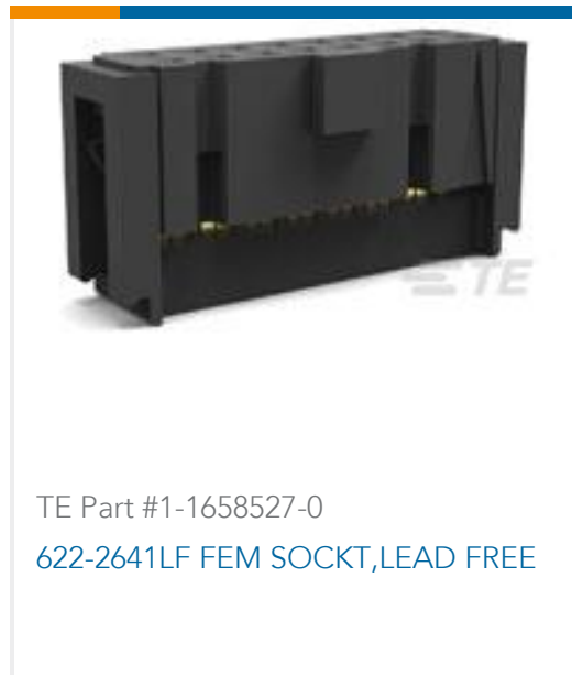
TE Part #1-1658527-0 622-2641LF FEM SOCKET, LEAD FREE