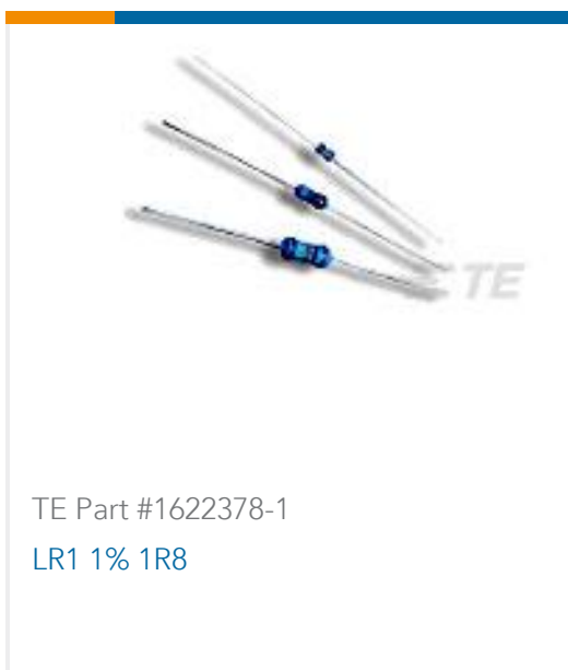
TE Part #1622378-1 LR1 1% 1R8