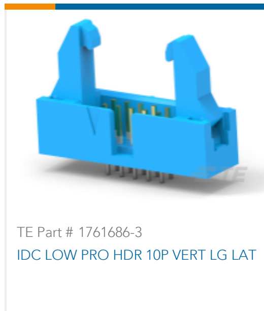
TE Part # 1761686-3 IDC LOW PRO HDR 10P VERT LG LAT