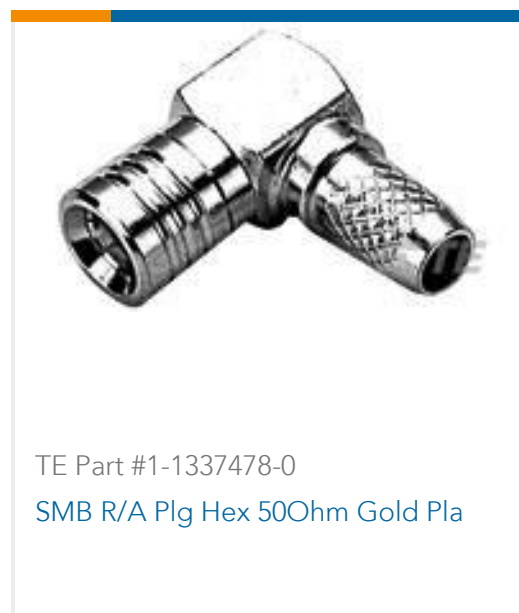
TE Part #1-1337478-0 SMB R/A Plg Hex 50Ohm Gold Pla