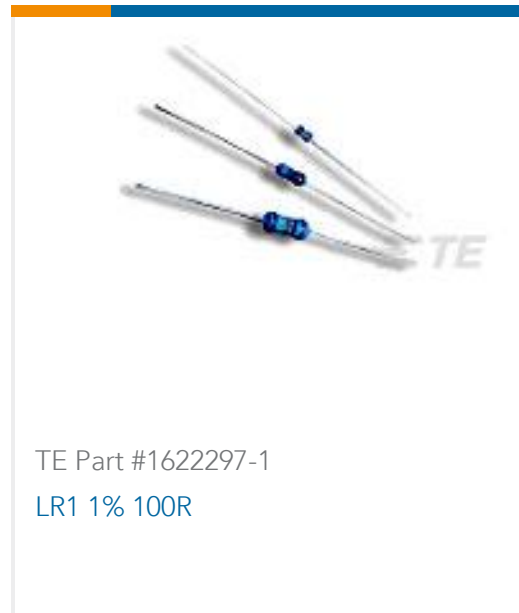
TE Part #1622297-1 LR1 1% 100R