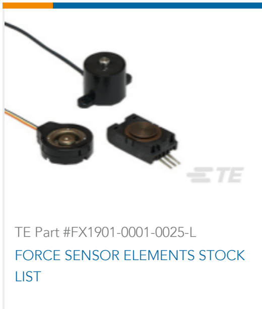
TE Part #FX1901-0001-0025-L FORCE SENSOR ELEMENTS STOCK LIST