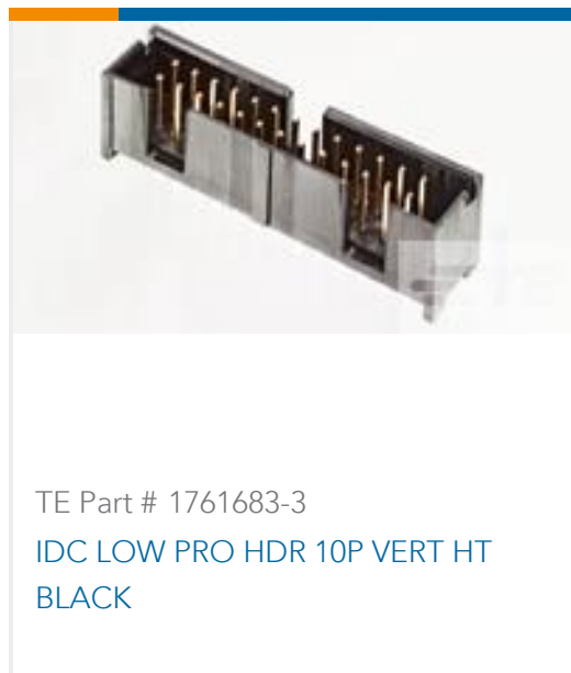
TE Part # 1761683-3 IDC LOW PRO HDR 10P VERT HT BLACK