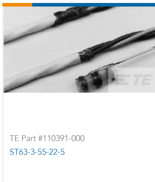
TE Part #110391-000 ST63-3-55-22-5