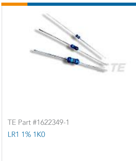
TE Part #1622349-1 LR1 1% 1K0