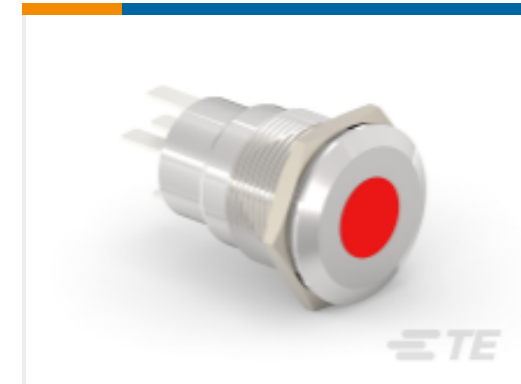
TE Part #2213765-7 AV19 SPM 5A SPOT LED RED 24V