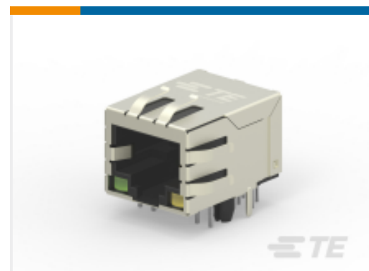
TE Part #2-2301994-3 RJ45 JACK INT.MAG. 1GB LED 1X1