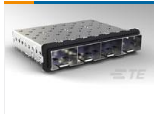
TE Part #2057833-1 SFP+ Enhanced 1x4 Cage Assy