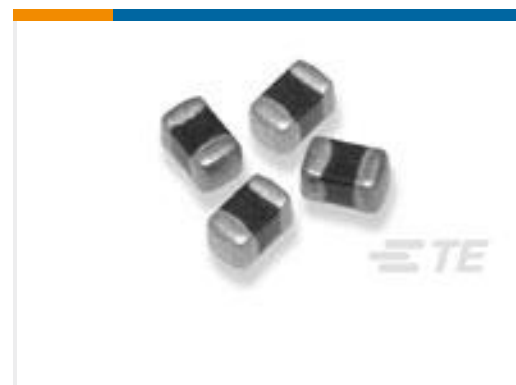
TE Part #2-1624116-6 BMB-A 0603 40R N8