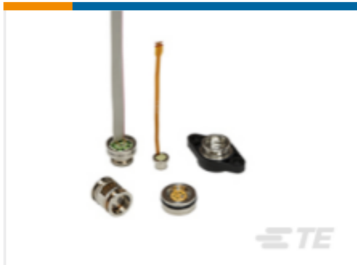
TE Part #154N-015G-R MEDIA ISOLATED PRESSURE STOCK LIST