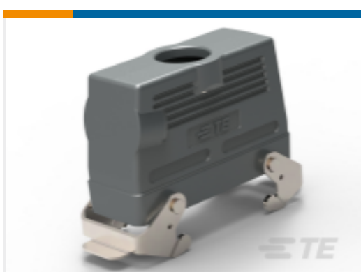
TE Part #T1280242132-000 H24B-TGBH-M32