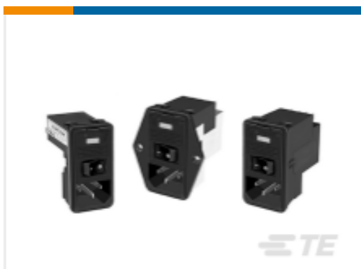
TE Part #1-6609106-4 CORCOM P SERIES MULTI-FUNCTION INLET FIL