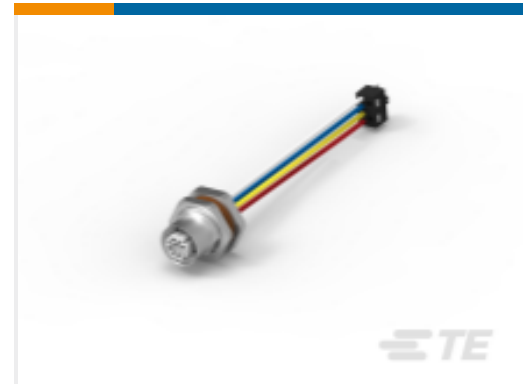
TE Part #1-2823589-2 M12 PCB MOUNTED