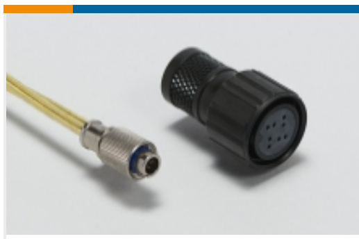
Standard Circular Connectors(13)