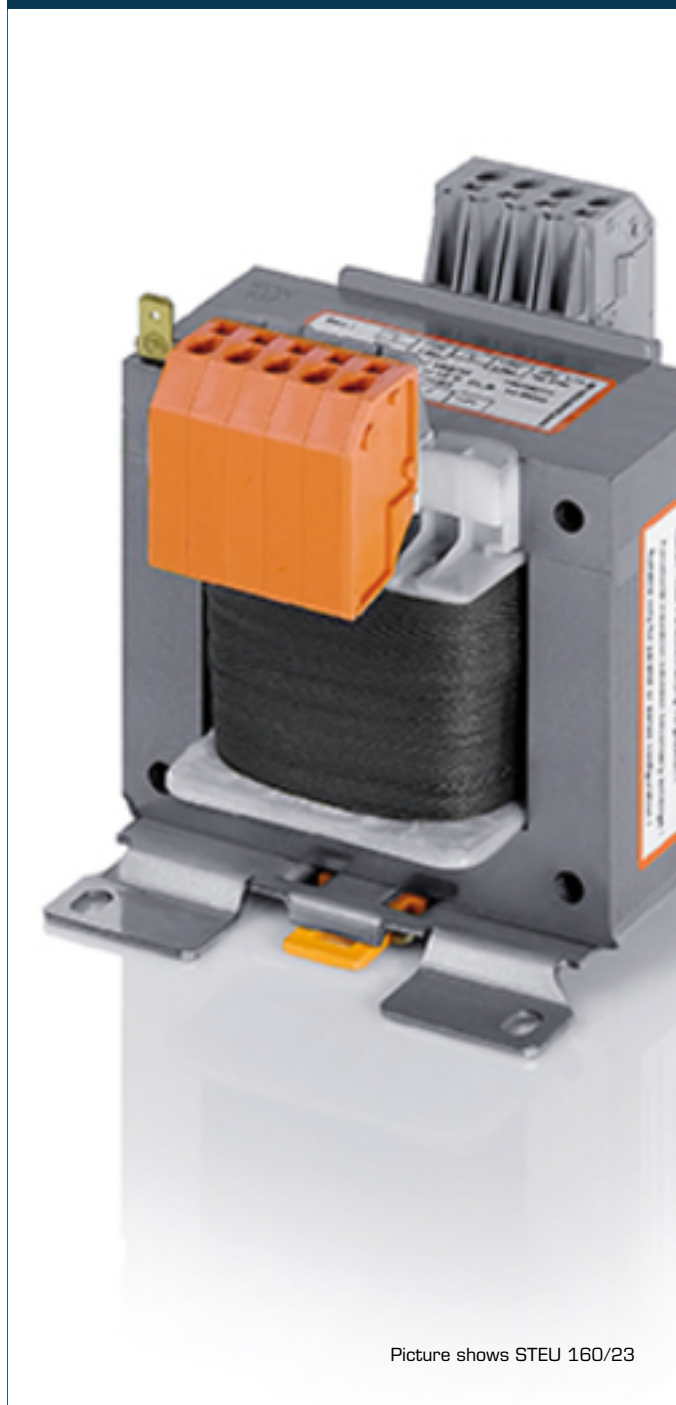
Picture shows STEU 160/23