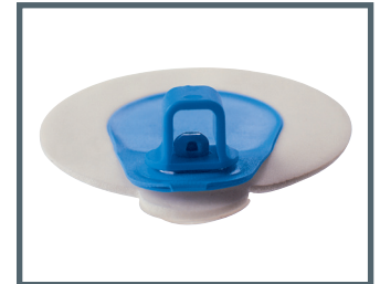
A = 4 mm fitting