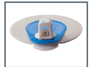
F = 3 mm fitting