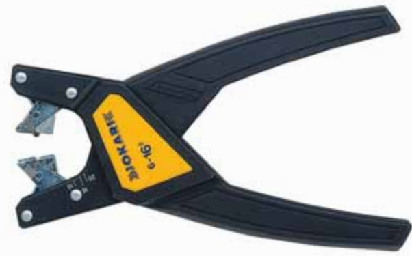
20090 Auto stripper