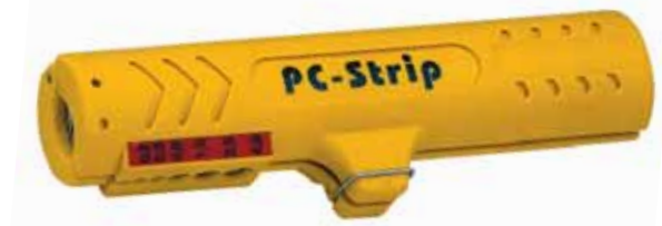
30160 Data Comm stripper PC

For fireproof cable. Retractable safety trimming knife blade and pocket clip. For standard and solid conductors. With additional precision conductor stripping blades.