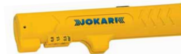
30140 Cable stripper Twin & earth flat

For round cable. Can be used on cable from 8mm to 13mm without the need for adjustment.