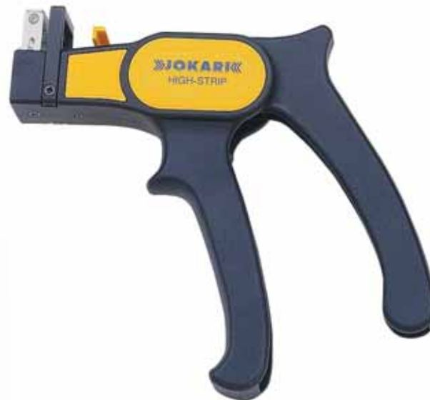
20450 Auto stripper High strip

For conductors with large cross sections. Also suitable for stripping sheathing from 3 x 0.75mm Ø PVC flex. No adjustment necessary.