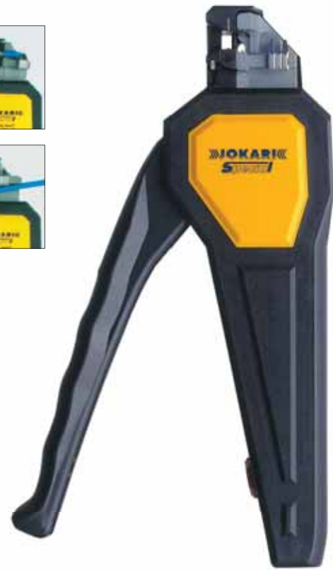
20060 Auto stripper Special