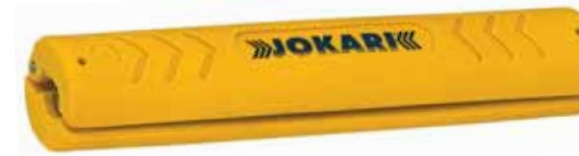
30010 Coax cable stripper