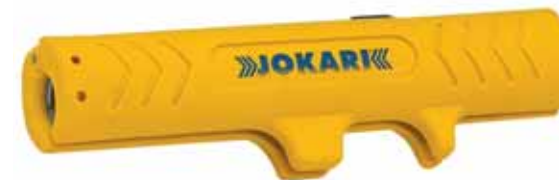
30120 Cable stripper

For all standard COAX cables e.g. TV coax, RG58U, RG59U etc. Also for 3 x 0.75mm 2 PVC flex. Stripping of outer sheathing with one side of tool and inner insulation with the other side. No adjustment necessary. With length stop.