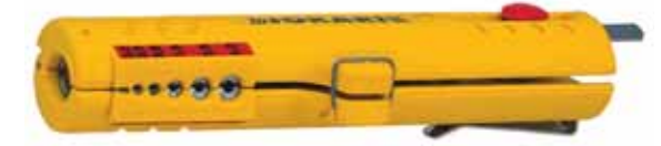
30150 Cable stripper FP

For flat or oval cables up to 12mm/1/2" wide. With additional precision conductor stripping blades.