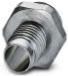
M8 pin, front mounting SMD with M10 screw fastening

Housing screw connection - SACC-FP-M-M8/M10 SMD - 1412502