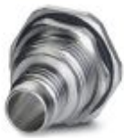
M8 pin, rear mounting

Housing screw connection - SACC-BP-M-M8/M12 SMD - 1412505