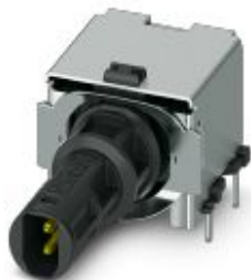
SPE PCB connector, type: IEC 63171-5, degree of protection: IP65/IP67, number of positions: 2, CAT B (ISO/IEC 63171), connection method: THR solder connection, Single Pair Ethernet

Please be informed that the data shown in this PDF Document is generated from our Online Catalog. Please find the complete data in the user's documentation. Our General Terms of Use for Downloads are valid ( http://phoenixcontact.com/download )