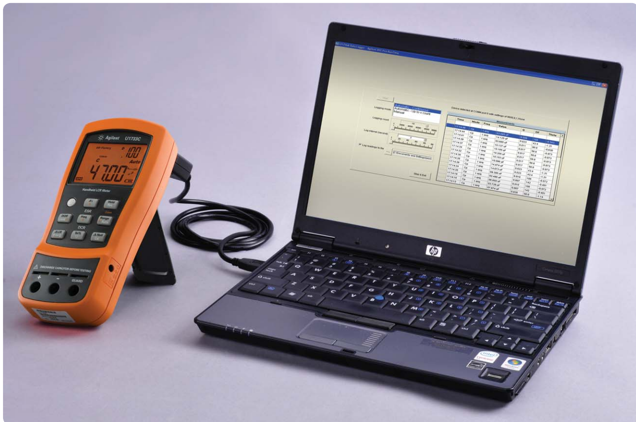
Figure 1. Automate the recording of continuous readings when you hook the U1731C/U1732C/U1733C to a PC

The handheld LCR meters allows you to test various component types, including secondary components of Dissipation Factor (D), Quality Factor (Q), and Angle Indication of Impedance ( \theta ). This new handheld series also includes other functions that result in a more detailed component analysis. For example, the built-in Equivalent Series Resistance (ESR) function helps you better understand the inherent resistance behavior typically found in capacitors across selected frequencies. DCR is a built-in DC resistance measurement that eliminates the use of a separate digital multimeter (DMM) for component test.