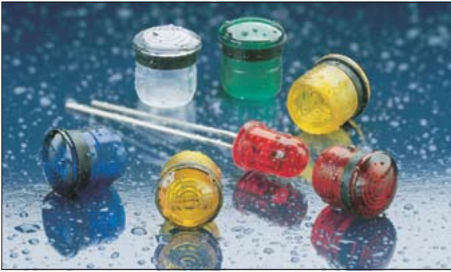
U.S. & Foreign Patents Issued and Pending