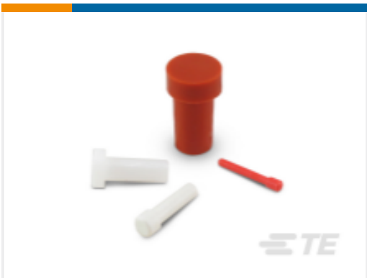
TE Part #114017-ZZ DEUTSCH SEALING PLUGS