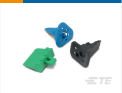
TE Part #W6P DEUTSCH DT WEDGELOCKS