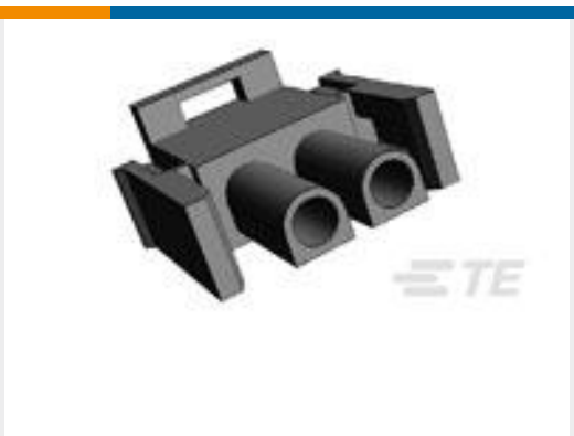
TE Part #1-480698-0 02P UMNL PLUG HSG NATL