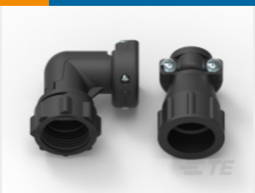
TE Part #206070-8 CPC CABLE CLAMPS