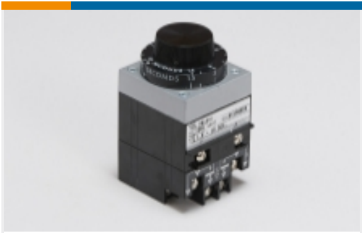
Time Delay Relays(214)