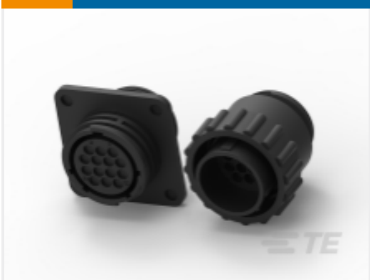
TE Part #206429-1 CPC SERIES 6