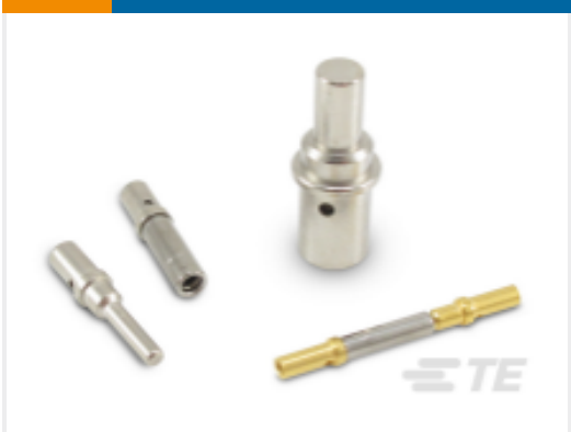
TE Part #0462-209-16141 DEUTSCH SOLID CONTACTS