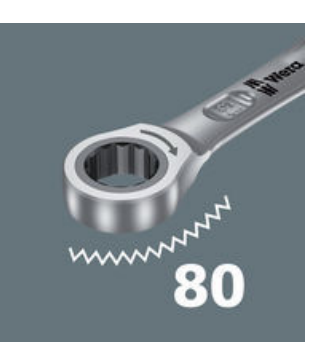
The ratcheting feature at the ring end boasts an exceptional, fine tooth mechanism – 80 teeth in all – which provides greater flexibility, even in very confined workingspaces.