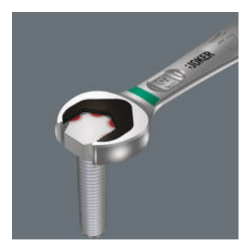
re-positioning of the Constant wrench? Difficulty holding fasteners in confined spaces? Easing off to avoid any risks of injury or fastener damage? That was yesterday. Today, the Joker prevents slipping off of the fastener head with its integrated limit-stop - no longer is the thumb needed to act as a depth stop. This makes applications much easier and allows signifi cantly more force to be applied during fastening jobs.