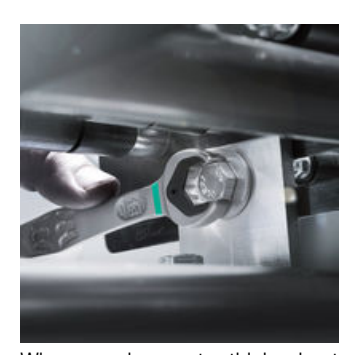
When we began to think about open-ended wrenches, we asked ourselves: why does the wrench always have to be flipped over; why does it have an offset design; why does it slip off injuring fingers? The new design of the mouth resulted in a real "Joker" that works even when all other trumps have been played.