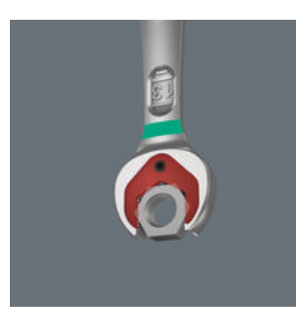
Joker's holding function The means that nuts and bolts can be held in the jaw and easily positioned where they are needed. Fastening on to the thread can then be done quickly and safely, thanks to the innovative special stop-plate which holds the fastener. No more time-wasting searches for dropped nuts and bolts! After applying and positioning the nut or bolt, fastening can begin immediately no additional tools required.