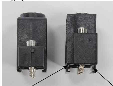
First slit for the fixing of the connector