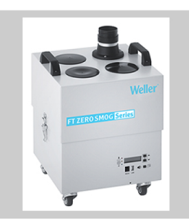
Solder fume extractors