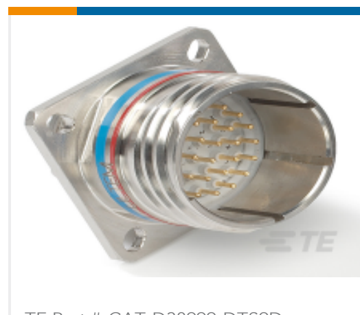
TE Part # CAT-D38999-DTS9D D38999: Square Flange, 23-53 insert