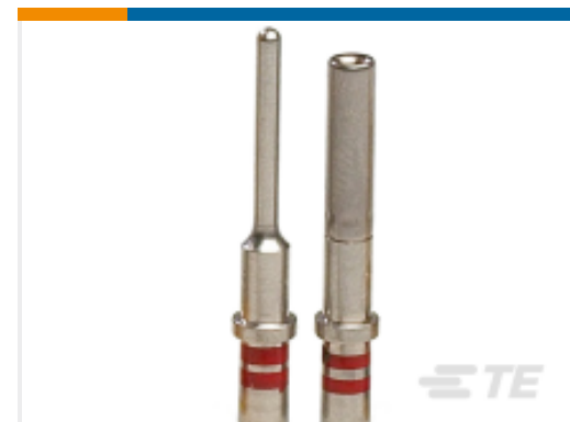
TE Part #ZPF000000000001261 097-0267-16 A1267