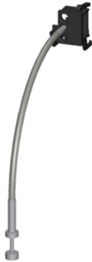
CABLE RELEASE WITH HOLDER FOR 3RU2 SIZE S00...S2