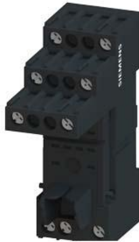
PLUG-IN BASE FOR PT-RELAY 2 CHANGEOVER CONTACTS, WITH LOGICAL DISCONNECTION