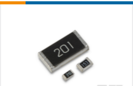
TE Part #1-2176328-4 CRGP 1206 120R 1%