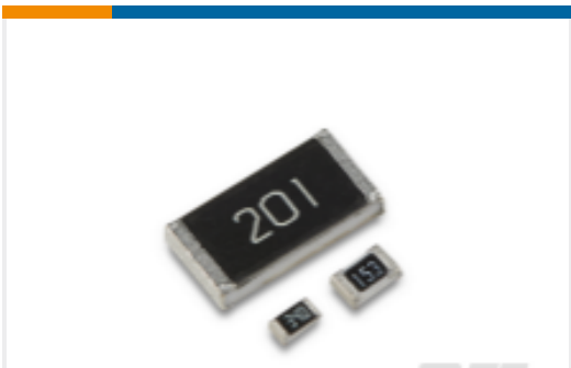
TE Part #1-2176325-9 CRGP 0402 330R 1%