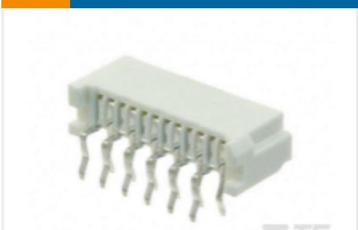
TE Part #1-84533-0 1.25mm FPC Connectors