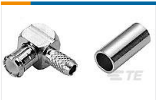
TE Part #1-1337585-0 MCX R/A Plg Hex 50Ohm Gold Pltd RG174A/U