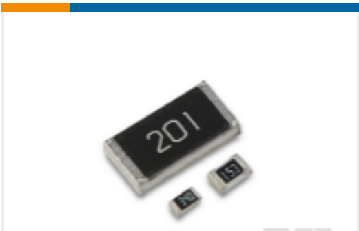
TE Part #1-2176326-5 CRGP 0603 150R 1%