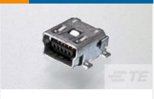
TE Part #1-1734035-1 MINI USB, TYPE B, R/A, SMT