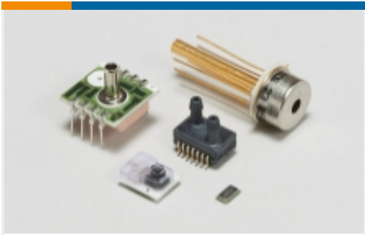
Board Level Pressure Sensors(19)