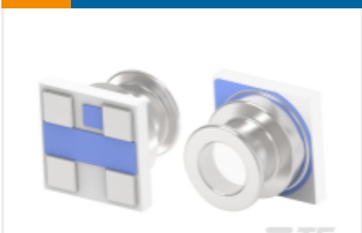
TE Part #MS563702BA03-50 BOARD LEVEL PRESSURE STOCK LIST