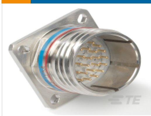
TE Part #YDTS20W17-26SNV001 RECP ASSY