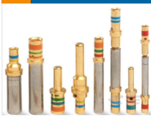
TE Part #0660-206-1631L CONT PIN