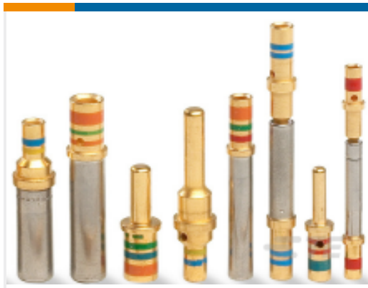
TE Part #38943-22L CONT SOC ASSY