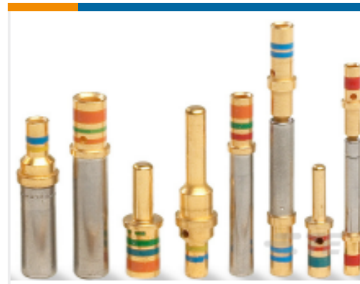
TE Part #2560-201-2031L CONT PIN