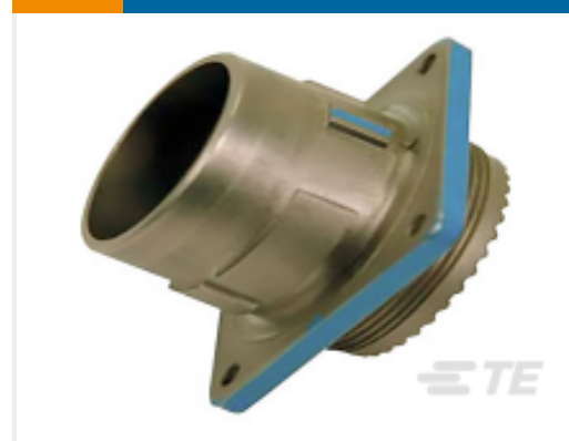
TE Part #YDIV46E25-04PNC009 PLUG ASSY