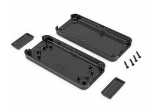
Basic configuration includes case, two end panels, and assembly screws