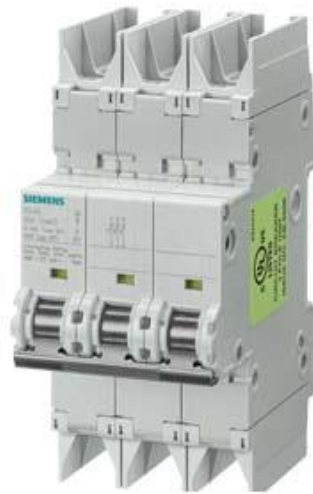
CIRCUIT BREAKER 10KA, 3POLE, C, 25A ACC. TO UL 489 - 480Y/277V