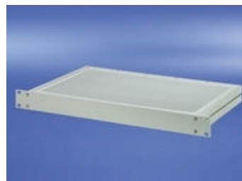
Photo shows 1 U