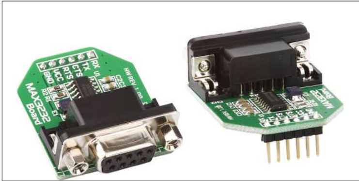
Figure 1: MAX3232 additional board