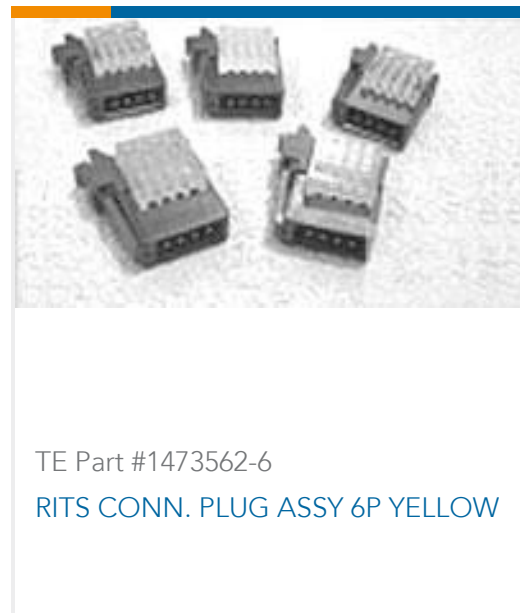
TE Part #1473562-6 RITS CONN. PLUG ASSY 6P YELLOW