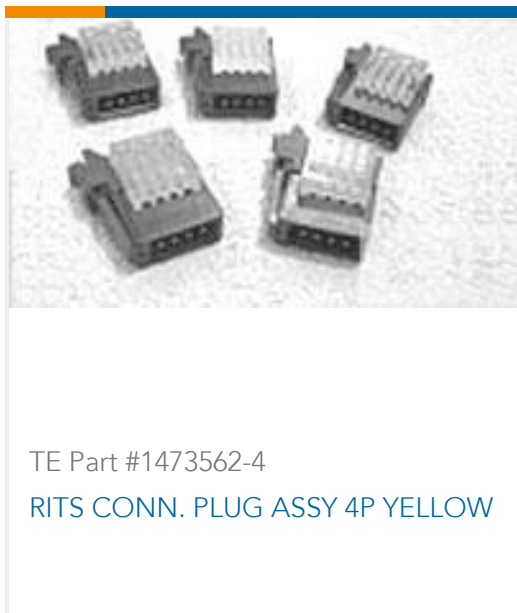
TE Part #1473562-4 RITS CONN. PLUG ASSY 4P YELLOW