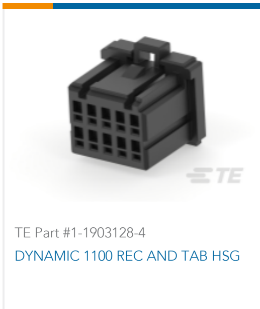
TE Part #1-1903128-4 DYNAMIC 1100 REC AND TAB HSG