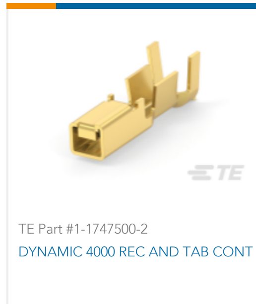
TE Part #1-1747500-2 DYNAMIC 4000 REC AND TAB CONT