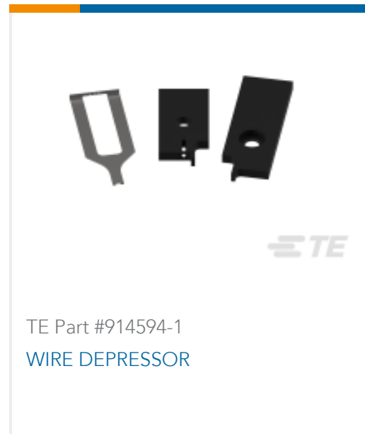
TE Part #914594-1 WIRE DEPRESSOR