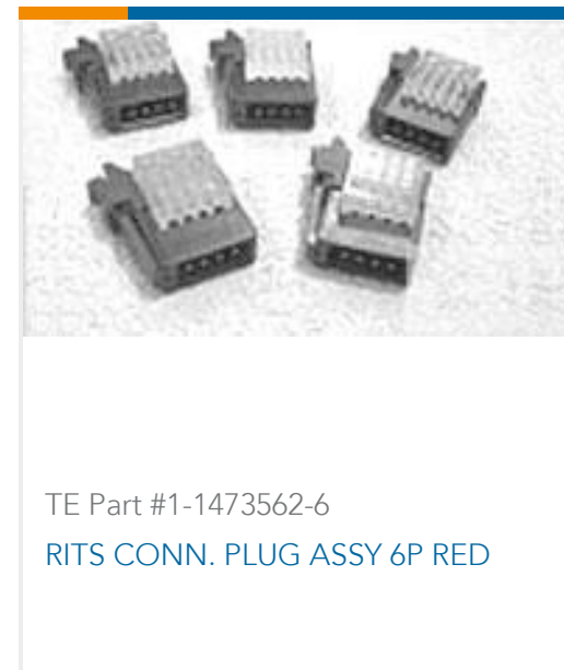
TE Part #1-1473562-6 RITS CONN. PLUG ASSY 6P RED