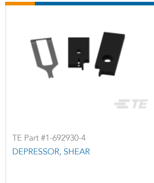
TE Part #1-692930-4 DEPRESSOR, SHEAR