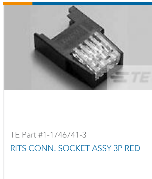
TE Part #1-1746741-3 RITS CONN. SOCKET ASSY 3P RED