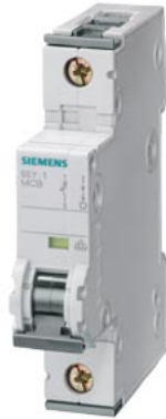
Miniature circuit breaker 230/400 V 6kA, 1-pole, C, 25A, D=70 mm