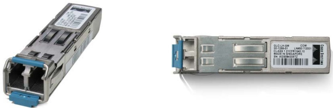
Figure 1. Gigabit Ethernet SFP

The industry-standard Cisco® Small Form-factor Pluggable (SFP) Gigabit Interface Converter is a hot-swappable input/output device that plugs into a Gigabit Ethernet port or slot, linking the port with the network (Figure 1). SFPs can be used and interchanged on a wide variety of Cisco Systems® products and can be intermixed in combinations of 1000BASE-SX, 1000BASE-LX/LH, 1000BASE-ZX, or 1000BASE-BX10-D/U on a port-by-port basis.