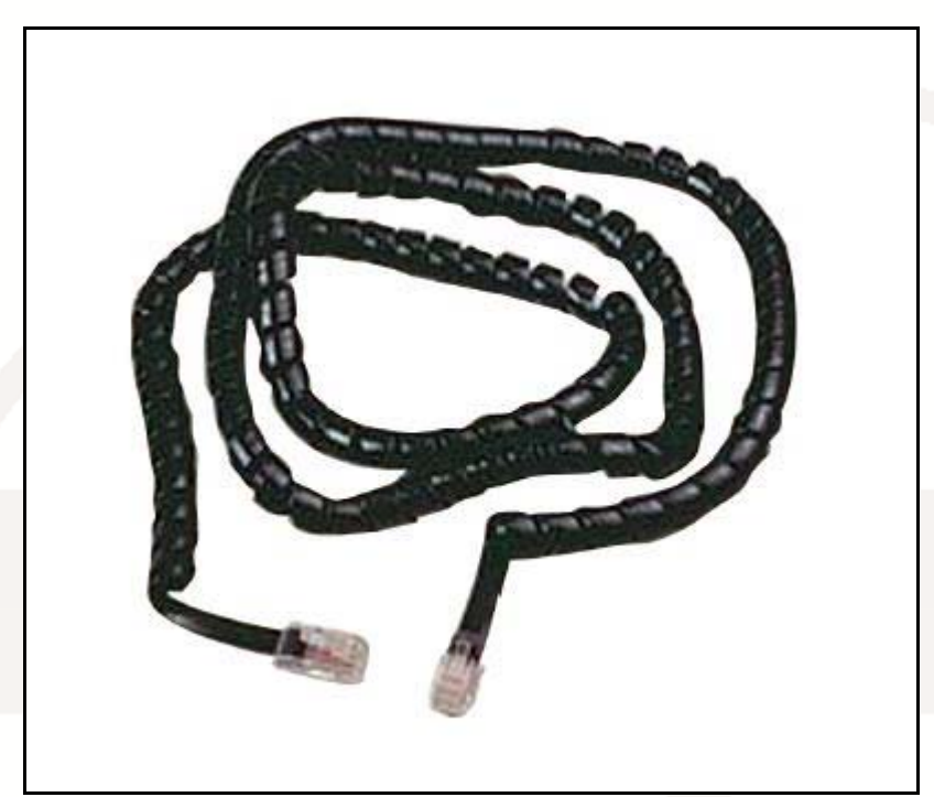
6p6c Black Coiled Lead for voice or data, wired pins 1:6 (CPJ) or 1:1 (CPJ2)