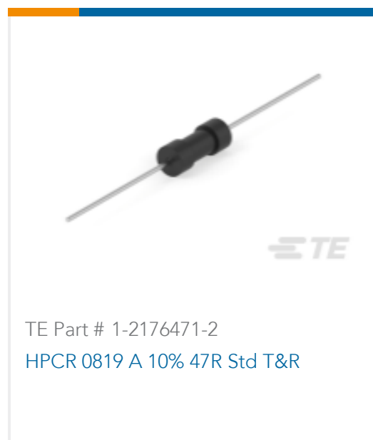
TE Part # 1-2176471-2 HPCR 0819 A 10% 47R Std T&R