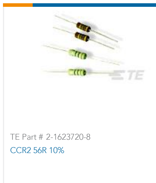
TE Part # 2-1623720-8 CCR2 56R 10%