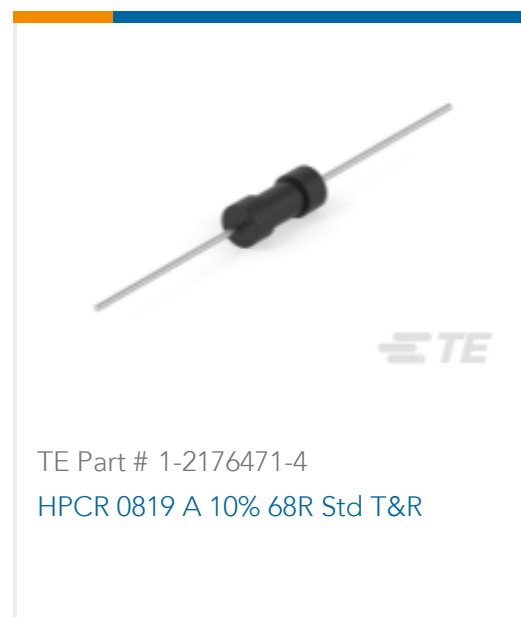
TE Part # 1-2176471-4 HPCR 0819 A 10% 68R Std T&R