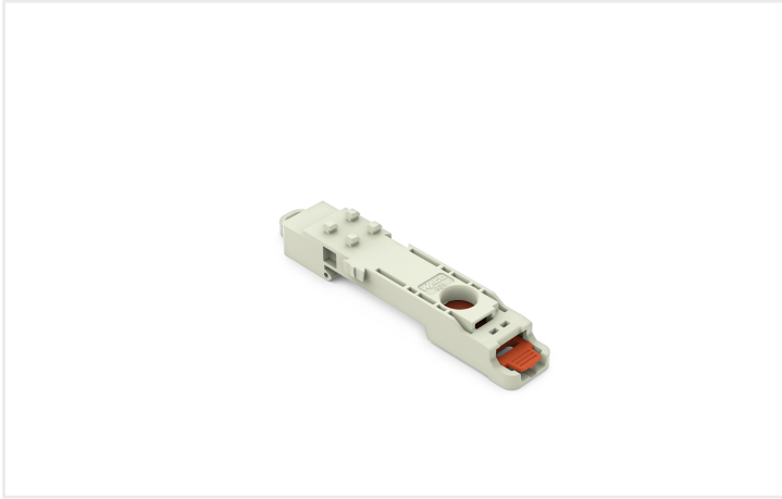
Color: ■ light gray