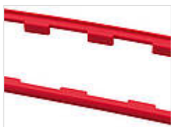
Seals, fire red