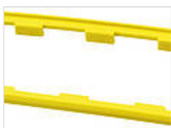
Seals, rape yellow