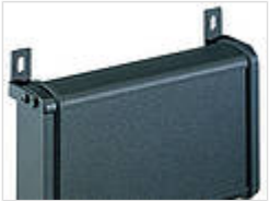
Wall brackets, sheet steel