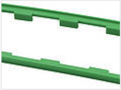
Seals, patina green