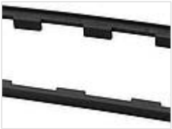
Seals UL 94 V0