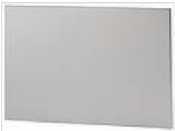
Front panels, natural-coloured anodised aluminium