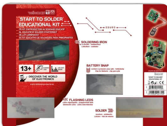
Handy storage box