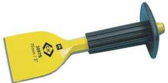
Brick bolster with grip