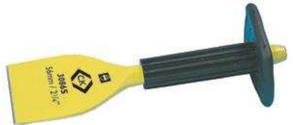
Electricians bolster with grip