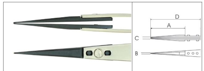
71ZJ.SA A 1.18" 30mm - B 0.03" 0.7mm - C 0.04" 1.0mm - D 1.77" 45mm _ Replaceable tips set code: A71ZJ