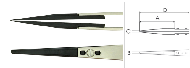
2AZJK.SA A 0.98" 25mm - B 0.07" 1.8mm - C 0.02" 0.6mm - D 1.57" 40mm _ Replaceable tips set code: A2AZJK