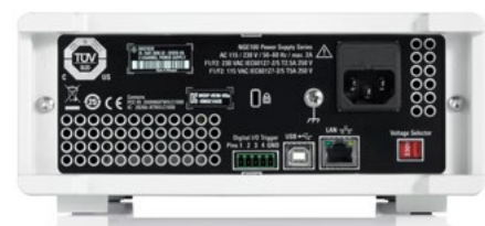
Rear view of the R&S®NGE100B series