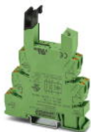
14 mm PLC basic terminal block without relay, for mounting on DIN rail NS 35/7,5, Push-in connection, 2 PDT, Input voltage 230 V AC/DC

Please be informed that the data shown in this PDF Document is generated from our Online Catalog. Please find the complete data in the user's documentation. Our General Terms of Use for Downloads are valid ( http://phoenixcontact.com/download )