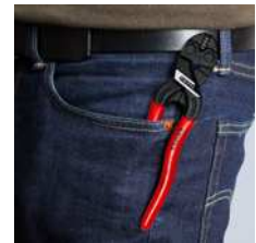
Compact, light and always to hand