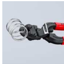
Powerful through to the tips