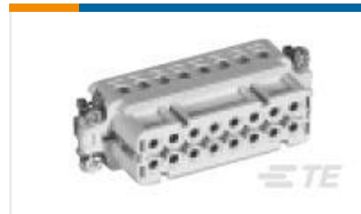
TE Part #1-1103417-1 HA.16.BU.S