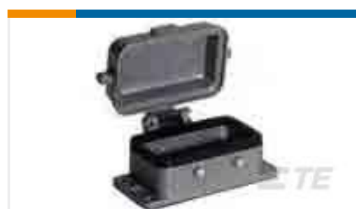
TE Part #1-1102340-6 HB.24.AGD