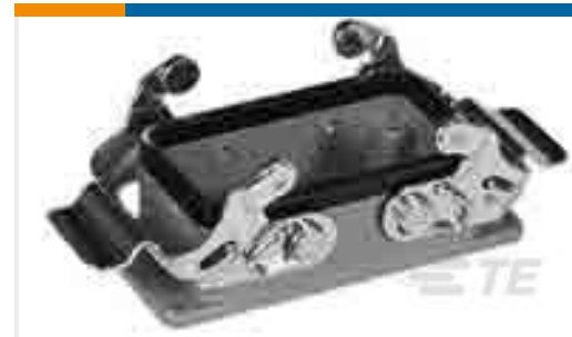
TE Part #1-1102291-1 HB.24.AG-VS