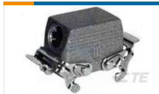
TE Part #1-1102292-1 HB.16.STS-VS.1.21.G