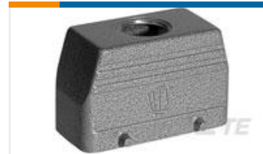
TE Part #1-1102295-6 HB.16.STO.1.21.G