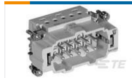
TE Part #1-1103636-1 HE.10.STI.S