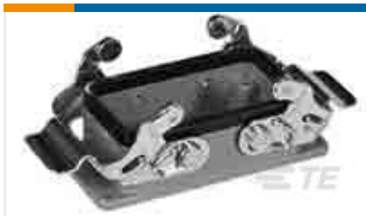
TE Part #1-1102296-1 HB.16.AG-VS