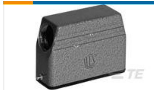
TE Part #1-1102292-6 HB.16.STS.1.21.G