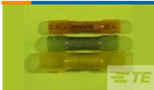
TE Part #CC2619-000 D-406-0001CS100