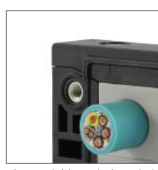
Also available with threaded bushings.