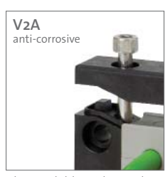
V2A anti-corrosive Also available with stainless steel screws (V2A).