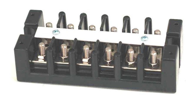
6 pole shown