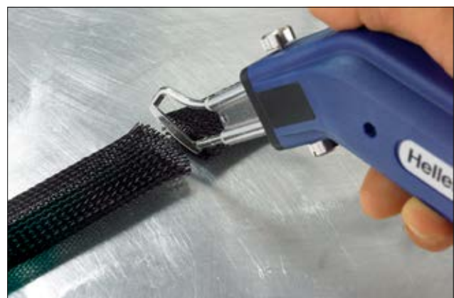
The HSGO hot cutting tool prevents the braided sleeving from fraying.

A replacement blade is available with the item number 170-99002.