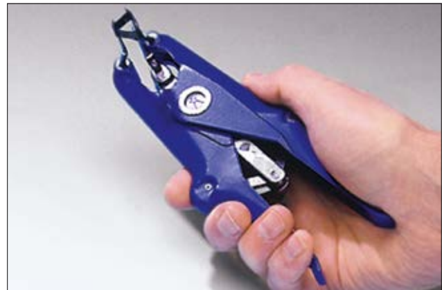
Fast, secure application with the three-pronged expansion tools.