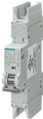
CIRCUIT BREAKER 10KA, 1POLE, C, 32A ACC. TO UL 489 - 277V