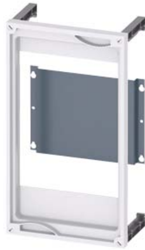
A400/630 MOUNTINGKIT H=450 W=251 X 3NP1153 (NH2) AT MOUNTING PLATE