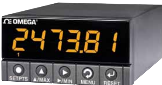
DP41-B, shown smaller than actual size.