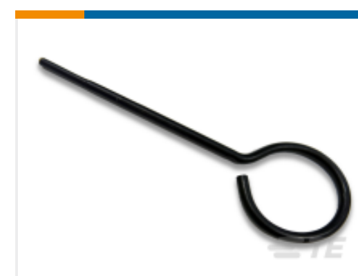
TE Part # 200893-2 INSERTION TOOL CONT