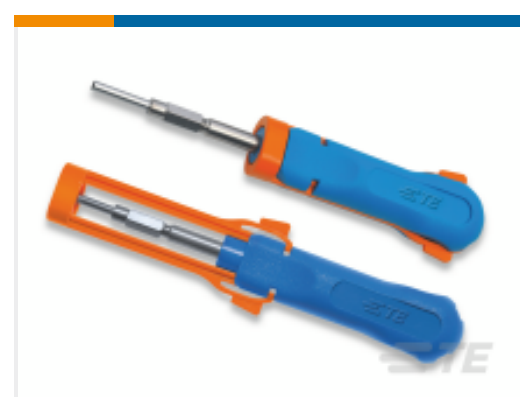
TE Part # 539972-1 EXTRACTION TOOL