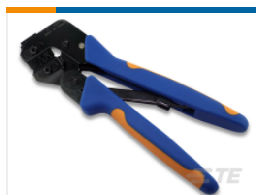
TE Part # 58495-1 PRO CRIMPER ASSY MULTIMATE