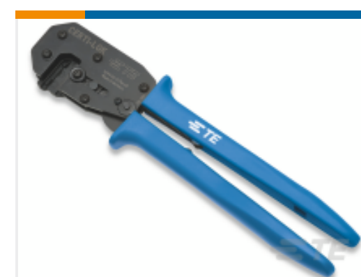
TE Part # 169400 CERTI-LOK FRAME W/O DIES