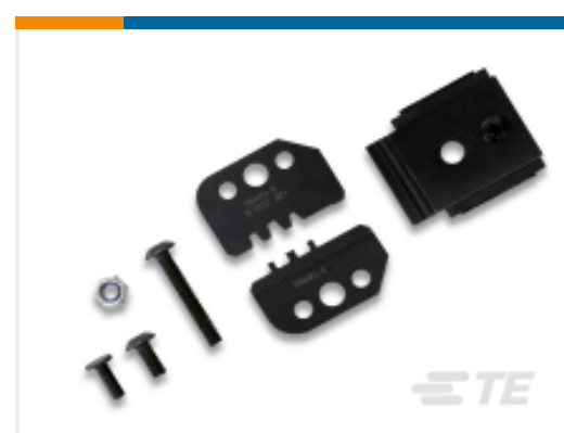
TE Part # 58495-2 PROCRIMPER DIE ASSY MULTIMATE