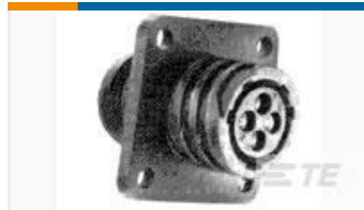
TE Part #206430-1 RECEPT, SZ 11-4, CPC