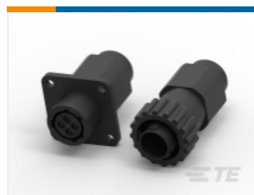
TE Part # CAT-AM71-C83998Y One-Piece Connector, Sealed, CPC Series 1