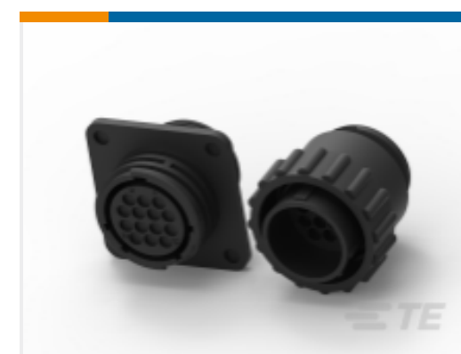
TE Part # CAT-AM71-C83998K Circular Connector, Environmentally Sealed, CPC Series 6