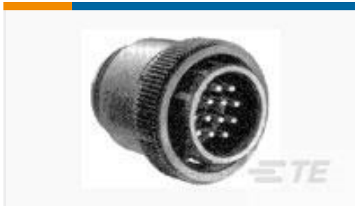
TE Part #206429-1 CPC PLUG ASSY, 11-4, REV SEX