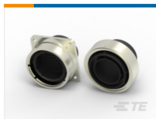
TE Part # CAT-AM71-C83998C Circular Plastic Connector, CMC Series 1