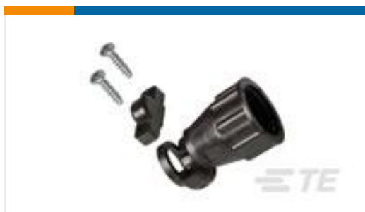
TE Part #1-206062-6 CABLE CLAMP KIT #11