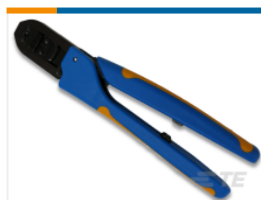
TE Part # 91515-1 CCII TYPE III+ MNL PIN SKT 30-20 ASSY