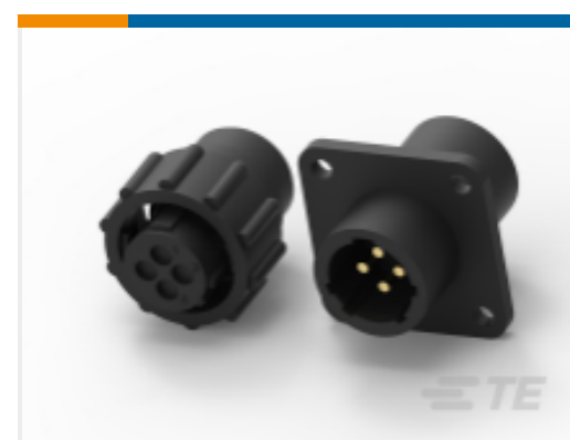
TE Part # CAT-AM71-C83998J Cable/Panel Mount Connector, CPC Series 1