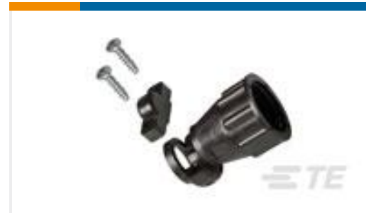
TE Part #1-206062-4 CABLE CLAMP KIT #11