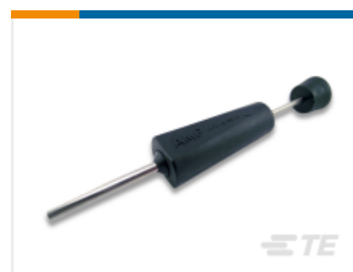
TE Part # 305183 EXTRACT TOOL TYPE 2 20-16