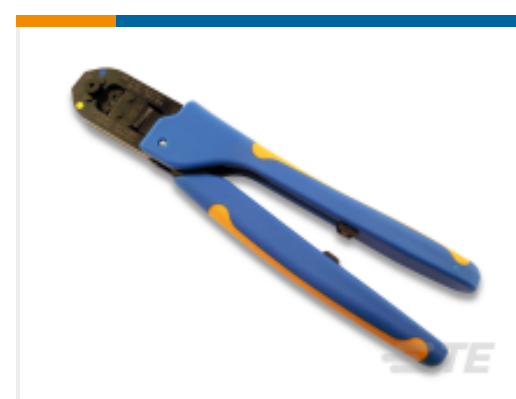
TE Part # 91505-1 CCII TYPE III+ 24-16 ASSY