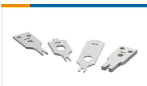
CRIMPER REPRESENTATION ONLY TE Part #9-1722380-0 CRIMPER, FERRULE 180 DEGREE